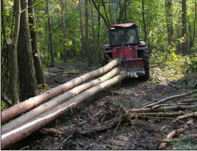
Fig. 3. FRANSGÅRD V-6000 GS cable winch Rys. 3. Wciągarka FRANSGÅRD V-6000 GS

by skidding after leaning tree-stumps against the winch plate. Manipulation plot areas were set up in such a way that the maximum logging distance of skidding in the first stage would not exceed 50 m.