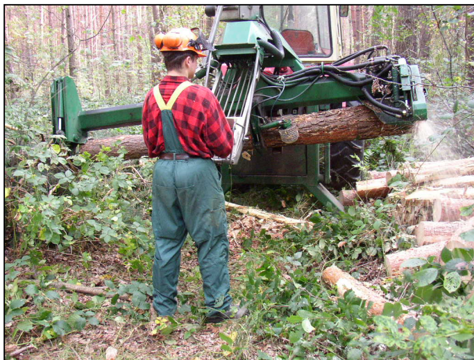
Fig. 2. NIAB 5-15 Processor Rys. 2. Procesor NIAB 5-15

by processors located on strip roads. The obtained basic material in the form of the middle-sized timber logs, was situated in irregular piles, directly by the routes from which it was then skid to depots by means of self-loading trailers. In case of technologies with cable winches, the logger's task, apart from felling and knocking down trees, was also debranching and cross-cutting the material. After cutting off the tree tops, the whole-length trees were skid to the skidding route by cable hauling, and transported to a depot