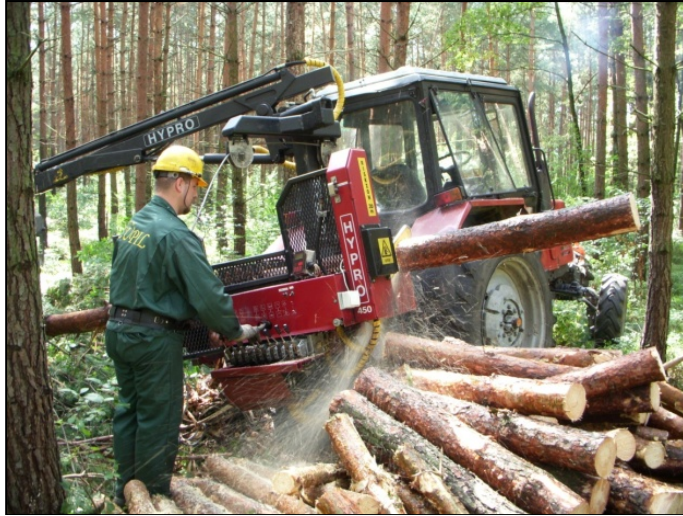
Fig. 1. HYPRO 450 Processor Rys. 1. Procesor HYPRO 450