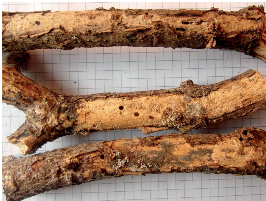
Fig. 2. Feeding ground of Enedreytes sepicola (Fabricius, 1792) on common hornbeam ( Carpinus betulus L.) with imago exit holes

of the Ascomycota type (Holloway, 1982; Oberprieler et al., 2007), which is rare among beetles as they generally prefer different groups of the Basidiomycetes (Basidiomycota) type. The locality of Anthribidae covers the whole Southern Europe, Central and Eastern Asia, Southern Africa, Central and Northern America, Australia and New Zealand. There are 3860 species known (in 1989: 3000 species were approximately known; Cmoluch, 1989) which homeland are mainly tropical countries (Rheinheimer, 2004). In Central Europe, the family is represented by about 30 species out of which 23 are found in Poland (Cmoluch, 1989; Wanat and Mokrzycki, 2005). However, Burakowski et al. (1992) indicates that Ulorhinus bilineatus Germar was vaguely disclosed from Silesia over a hundred years ago probably on the basis of an erroneous marking of the specimen. Therefore, it can be assumed that 22 species of the Anthribidae family have been recorded reliably on the Polish territory (Stachowiak, 2002).