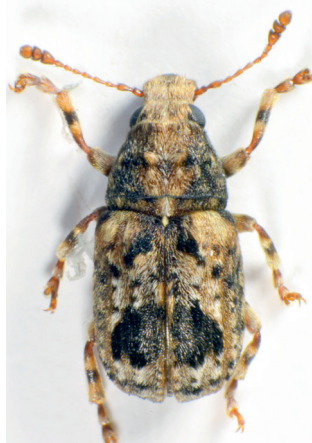
Fig. 1. Male of Enedreytes sepicola (Fabricius, 1792) from D. Bruder's collection

Enedreytes sepicola Fabricius, 1792 (Fig. 1) has been found in the discussed area among many widespread species of beetles. From the obtained plant material