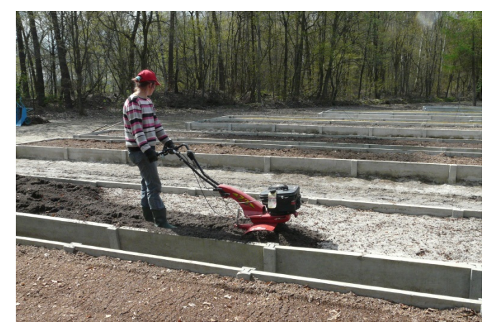
Fig. 5. Preparation of soil in corridors using diesel cultivator Rys. 5. Stosowane w praktyce przygotowanie gleby w korytach za pomocą glebogryzarki spalinowej

caused by shoes shown on picture 5 (Fig. 5) are later seized with rakes which only leads to additional deterioration of fertilizer uniformity (in places of depressions will be more fertilizer) and does not eliminate local compaction of the substrate.