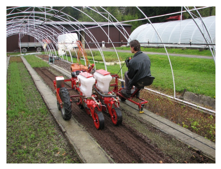
Fig. 7. Usage of PK type seeder to spot sowing in foil tent Rys. 7. Siew punktowy siewnikiem typu PK w namiocie foliowym

Recently, thick seeds spot seeding section of Agricola Italiana type PK seeder was modified in order to use in spot seeding, so now it can sow either thick or tiny seeds. This solution allows spot seeding of all forest tree seeds both thick and tiny while using the same seeder sowing section (Fig. 7).