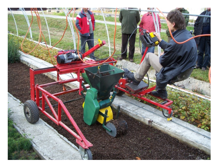
Fig. 6. Substrate dispenser during work in foil tent Rys. 6. Dozownik substratu podczas pracy w namiocie foliowym

preparation of the whole seeding perch can be made in few rides. This allowed to significantly reduce the weight of the dispenser and its requirements for drive power. A lower efficiency of the machine acquired through that is irrelevant, because soil preparation process is significantly sped up compared to the existing manual preparation, and machine itself is used only few days in a season.