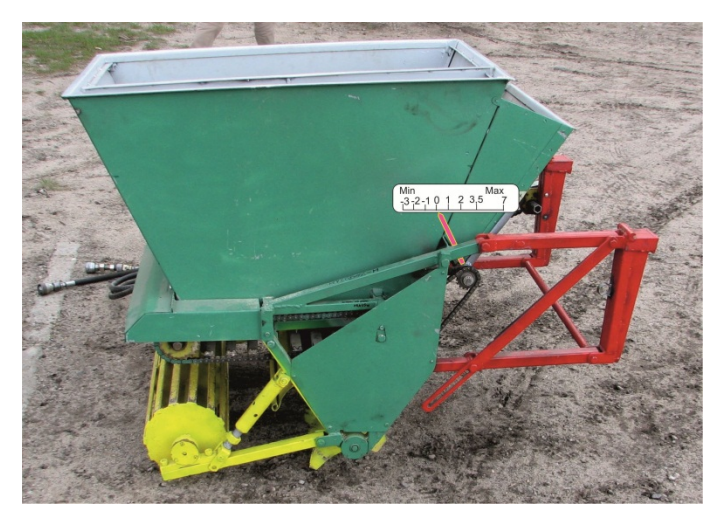
Fig. 4. Dispense outlet regulating lever with position scale Rys. 4. Dozownik z widoczną skalą położenia dźwigni regulującej wielkość wylotu