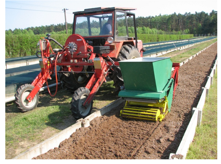
Fig. 3. Dispenser during work in corridors Rys. 3. Dozownik podczas pracy w korytach