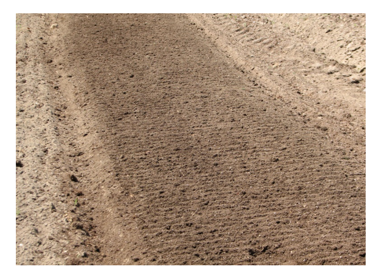
Fig. 2. Soil prepared for sowing Rys. 2. Gleba przygotowana do siewu

At the bottom of loading box with capacity of 3 m<sup>3</sup>, SRS Fertilizer dispenser has floor conveyor which allows to dispense up to 3 m<sup>3</sup> of substrate per ar. The dispenser placed in the front part of the machine evenly spreads the substrate dosed at the set amount. Later it is mixed with the top layer of soil by the cultivator placed in the rear of the dispenser and thickened with a string shaft. Floor conveyor drive is made of gearing and hydraulic motor which allows a wide range of substrate regulation. Fertilizer is particularly useful for dispensing substrate with micorrhizal fungi which is sensitive to drying and requires mixing with soil throughout the entire working depth right after dispensing on surface. This machine has allowed developing of new miccorhizal seedlings production technology. It allows to use worn out substrate which was used for production of micorrhizal seedling in corridors instead of micorrhizal biopreparate in open nurseries [Ektomikoryzy... 2007]. Soil prepared in this way is ready for seed spot seedling (Fig. 2). The cultivator is connected with a substrate dispenser with three-point suspension system which allows each machine to work independently.